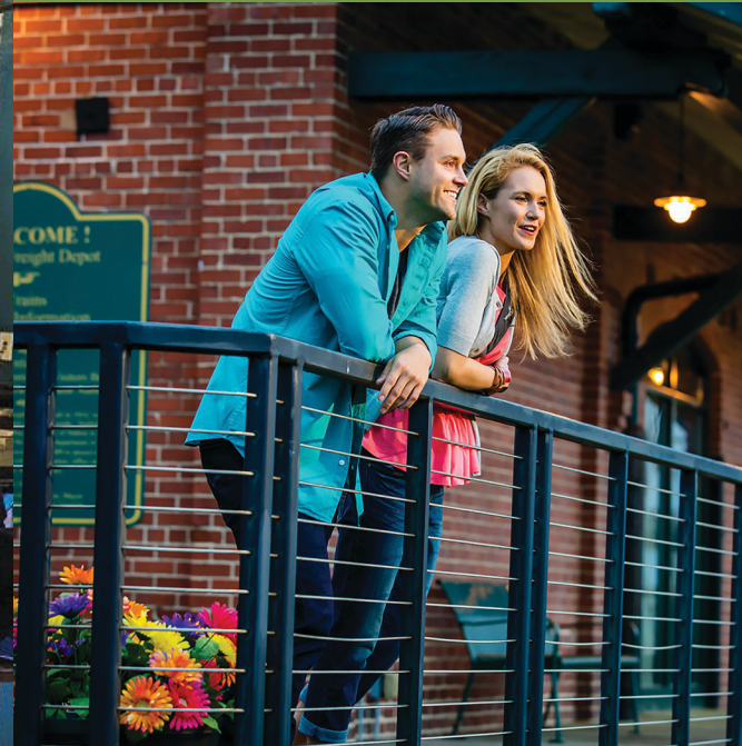
Native Kitchen The Mill - 825 Chattanooga Ave