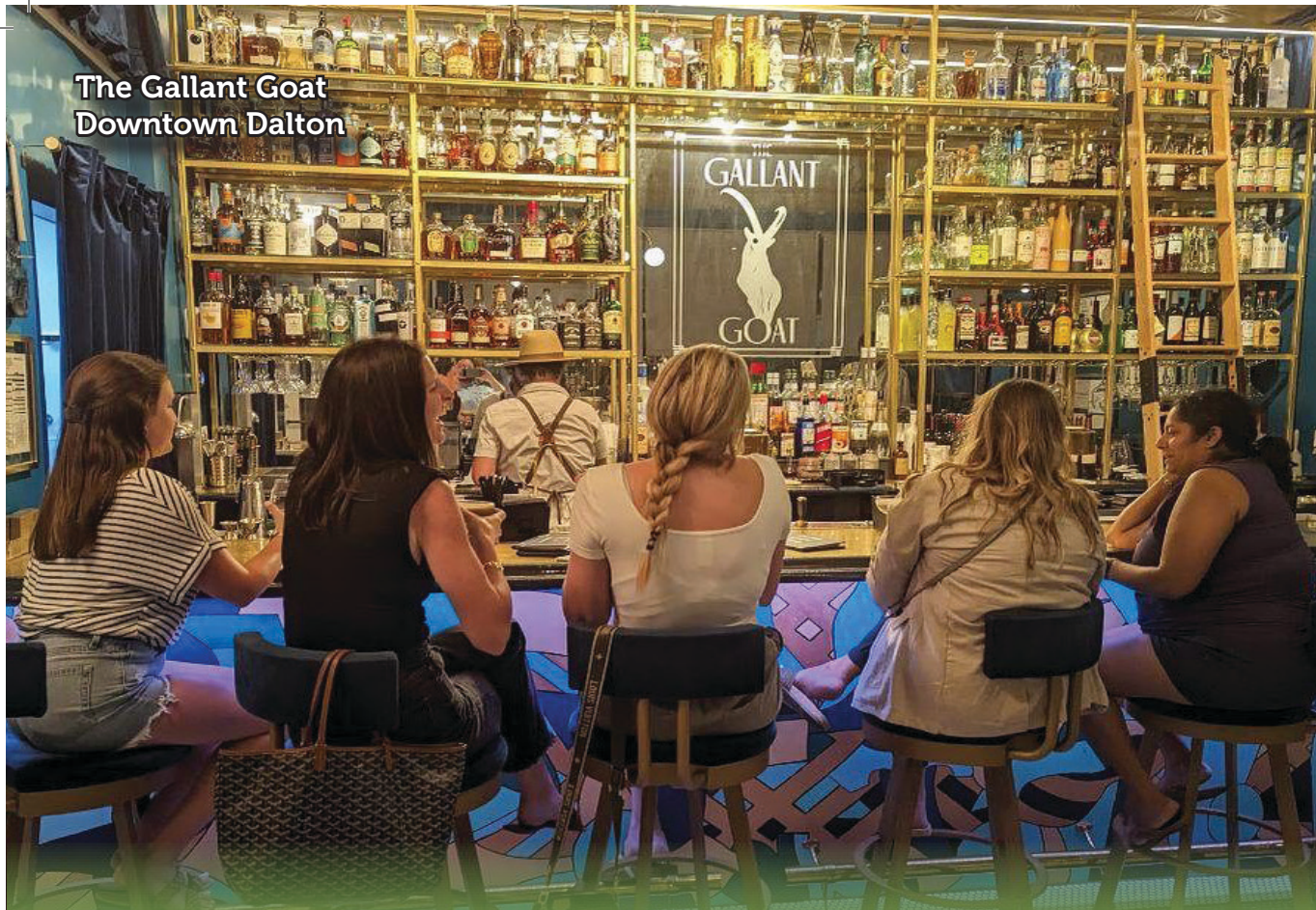
The Gallant Goat Downtown Dalton