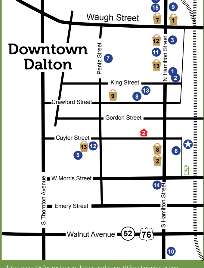
^st See page 18 for restaurant listing and page 20 for shopping listing.